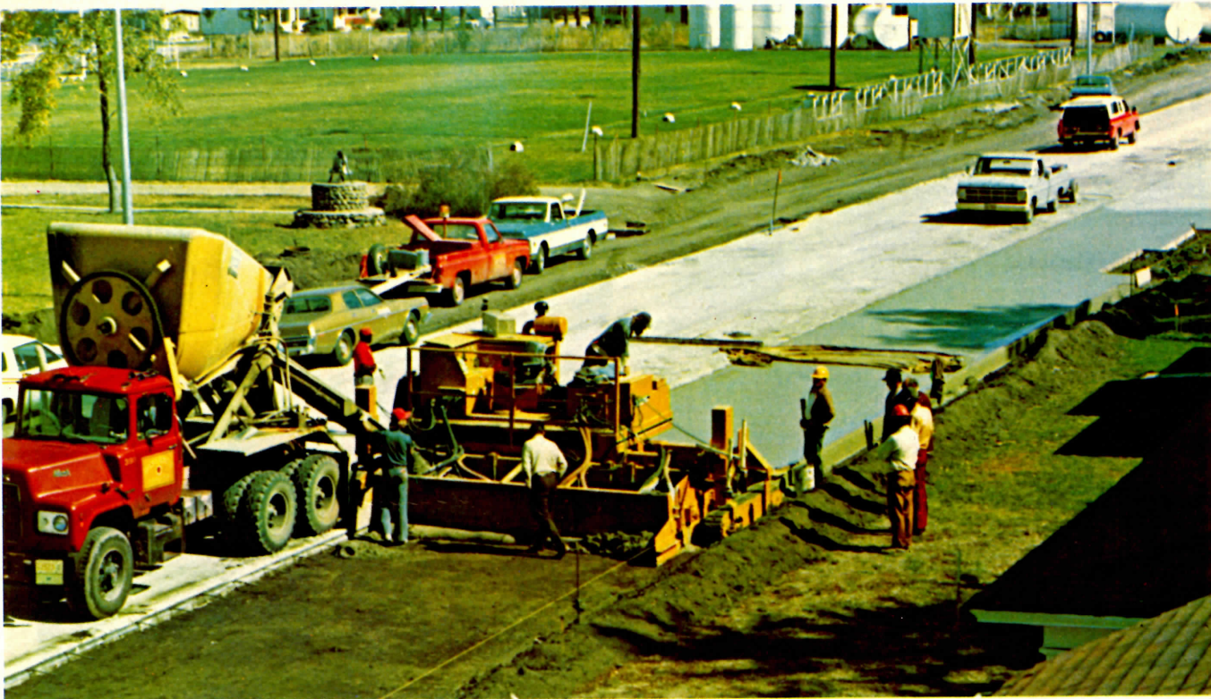
GOMACO HW-165 Half-Width Urban Paver slipforms integral curb and streets up to 18 feet wide. Additional concrete placed ahead of the HW-165 on subgrade allows up to a mile per day production.