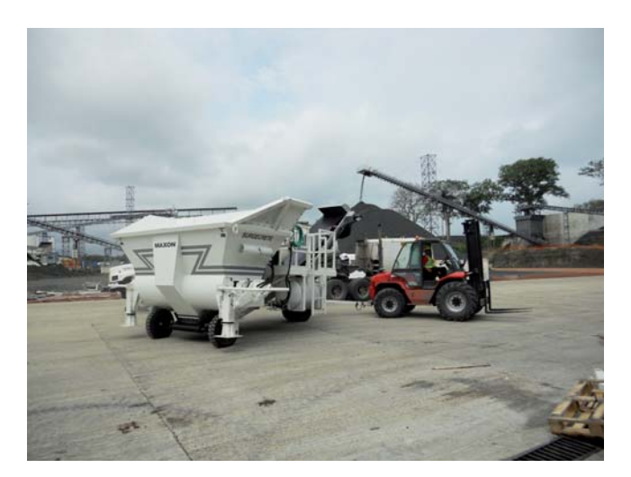
Versatile Maxon Surgecrete with tri-axle trailer configuration allows for easy towing to different placement sites on the project. Once in position outriggers provide for quick setup.