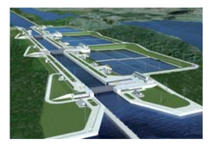
Computer rendering of completed Panama Canal lock addition. The new locks will run parallel to the existing Canal/ Locks and offer a third lane and set of locks for today's larger vessels.