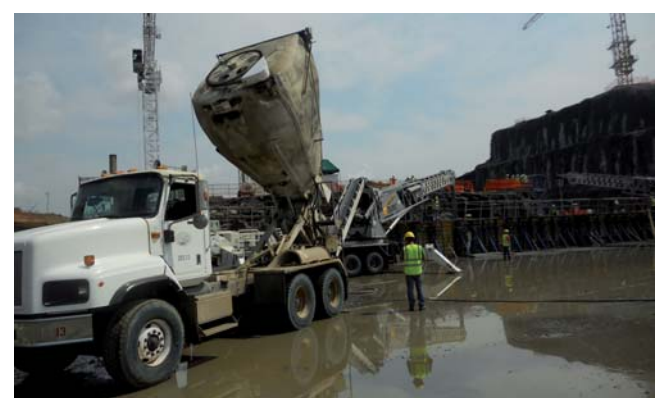
Maxon custom insulated the Agitor bodies to transport the super cooled concrete (ambient temperatures can exceed 90^{\circ} \text{ F} / 30^{\circ} \text{ C} ).

Maxon Industries Inc. ■ 3204 W. Mill Road ■ Milwaukee, WI 53209 ■ Phone: (414) 351-4000 Fax: (414) 351-9057 ■ Website: <u>www.maxon.com</u> ■ E-mail: sales@maxon.com