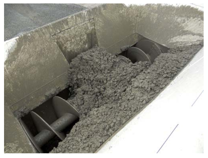
View inside Surgecrete: Bi-directional auger moves even the stiffest of concrete mixes to the hydraulically operated discharge gate, and onto the 36" discharge belt.