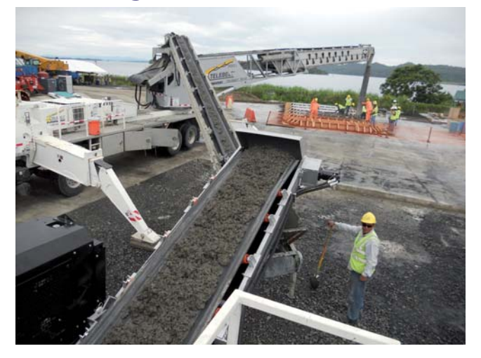
36" wide variable speed discharge belt on the Maxon Surgecrete matches the placement rate of the Putzmeister Telebelt.