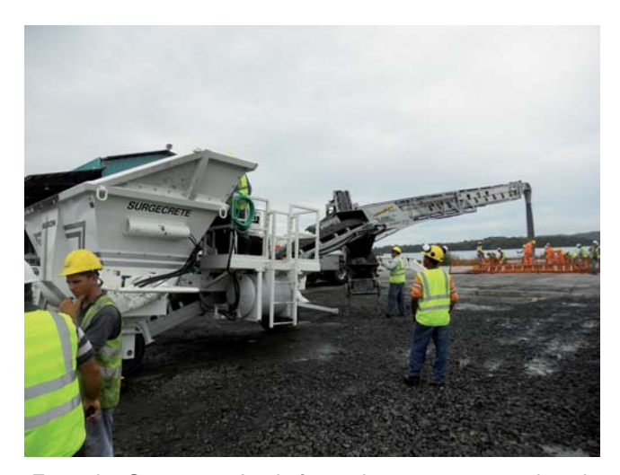
From the Surgrecrete's platform, the operator can view the Maxon Agitors discharging into the Surgecrete hopper and the concrete feeding to Putzmeister Telebelt, thus ensuring quality concrete throughout the delivery process.