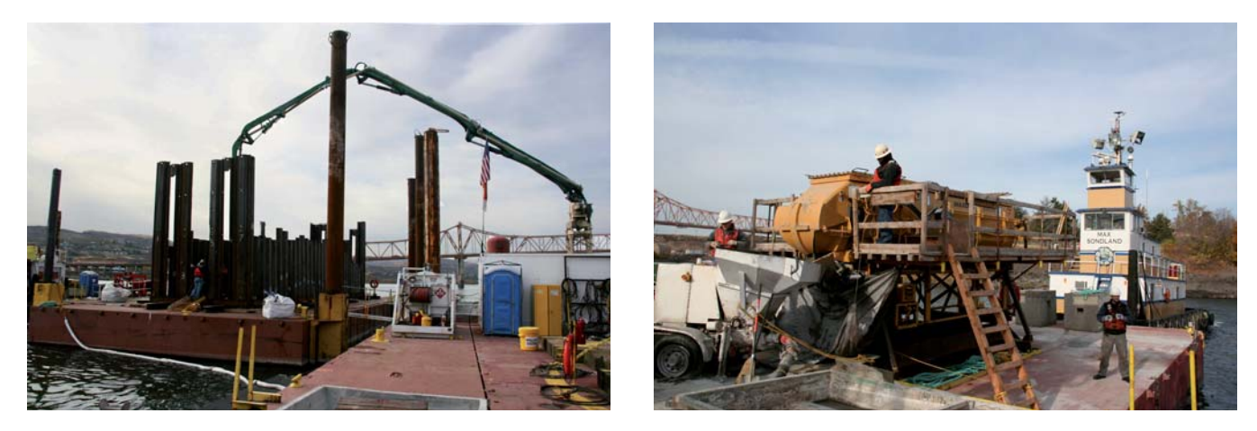
At right - Maxcrete operator feathers controls to match concrete discharge speed of Maxcrete to trailer pump. At left - 36 Meter Putzmeister Placing Boom feeds concrete over the wall of the moon pool to the divers underwater placing the rut slabs

Maxon Industries Inc. ■ 3204 W. Mill Road ■ Milwaukee, WI 53209 ■ Phone: (414) 351-4000 Fax: (414) 351-9057 ■ Website: <u>www.maxon.com</u> ■ E-mail: sales@maxon.com