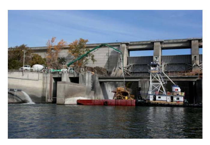
9 cubic yard truck mixers and 32 meter concrete boom truck feed concrete to barge mounted Maxcrete

The concrete for the rut pours consisted of a <sup>3</sup>/<sub>4</sub>" minus aggregate self levelling mix with roughly a 20" plus spread, and included anti-washout/Devo to allow for direct placement underwater.