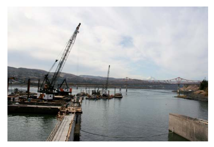
(View looking down stream): Shorter Spillway Wall 5/6, built in 2004, is shown in foreground at right, new 830-foot Spillway Wall 8/9 extends downstream from the dam at left, in the final stages of construction (snow covered Mount Hood visible on the horizon)

dam and fish migration schedules, we are ahead of schedule and anticipate being under budget," reflected Bowman with a smile on his face. He's looking forward to his next well-run project. As for the fish, next Spring's dam spill of this winter's snow run-off and the survival rate of the migrating fish will be the ultimate testimony of the success of the project.